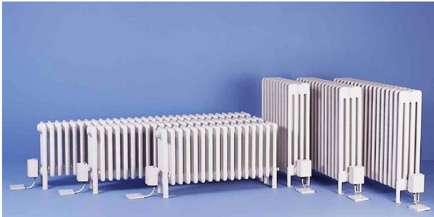
Various sizes in white with elements

Price list with effect from 1 st January 2011.