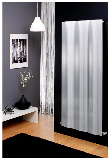
Motus Line MOL/180/075 in polished (side panels not available)