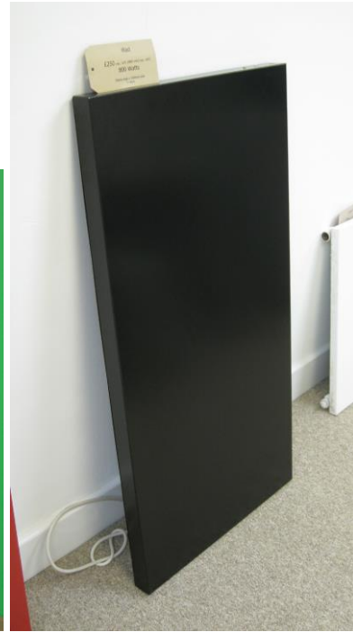
Models pictured may be different sizes to those being sold.

iRad as a stand-alone unit – each radiator has a simple on/off switch. An iRad Controller is not necessary to operate one iRad working alone, but may be desirable for greater control (thermostat and timer).