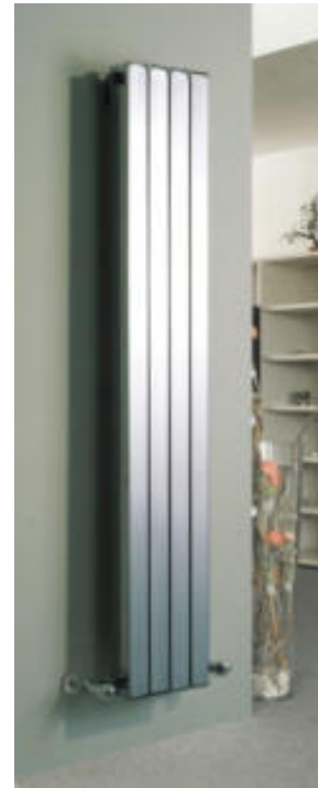
vertical model with side connections