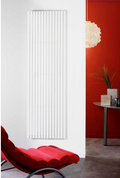
Verso single vertical (pictured without valves)

Pricelist with effect from 1 st October 2011