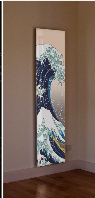
Hokusai wave design

Picture this, a slimline electric radiator with a choice of five stunning images printed on the front face. Work of art and efficient practical heater in one. The iRad Picture makes a statement, and brings warmth and style to any room it graces. This radiator can be used with a remote iRad Controller, allowing you to set the temperature and operating times.