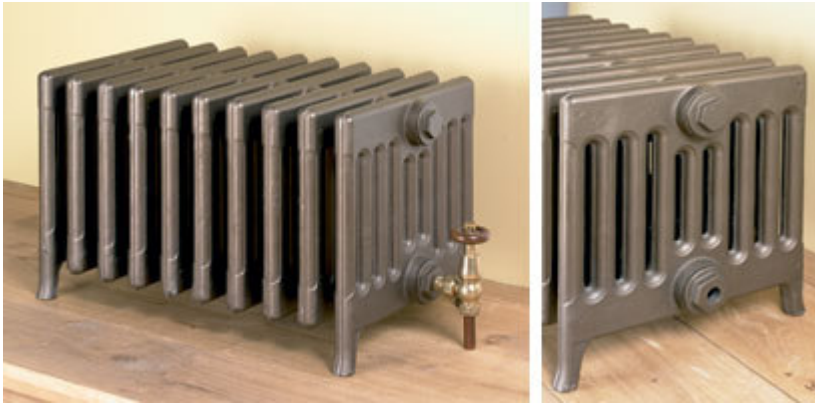
10 section old penny