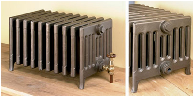
10 sections in old gold