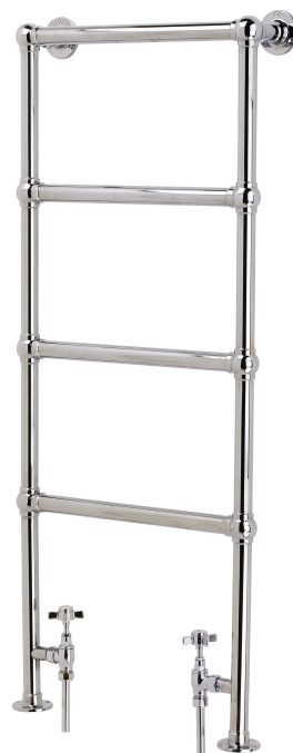
Moreton floor-mounted – LG021A

Bring authenticity and luxury to your bathroom with the Moreton. This handsome range of ball jointed towel radiators are hand finished in the UK and made of solid brass finished with a luxurious coat of chrome (other metal finishes available by special order). Listed below are details of the most popular sizes (wall and floor mounted versions). Further sizes available by special order.